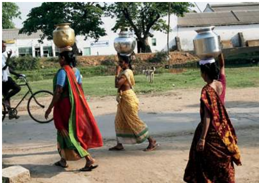
Figure 10: Traditional water carrying

One part of improving access to water was the water trolley made by using locally sourced materials that are easy to obtain. IDEO collaborated with local craftsmen to model a number of design options (see Figures 11 and 12 ).