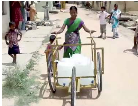
Figure 11: IDEO water trolley