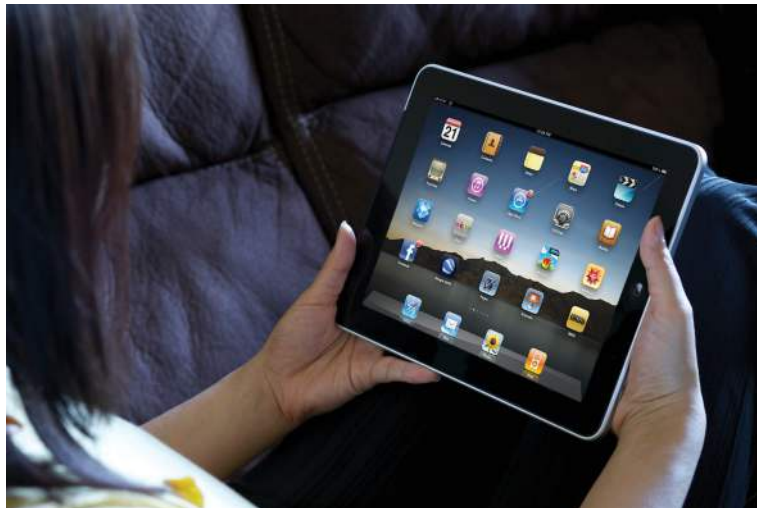
Figure 9: Apple iPad

The iPad was labelled as a competitor to laptops and was the first product of its kind to diffuse into the market. Even though the iPad is a relatively new product, it has already been recognized as a design classic.