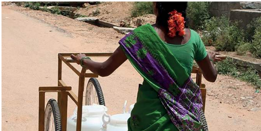
Figure 12: IDEO water trolley