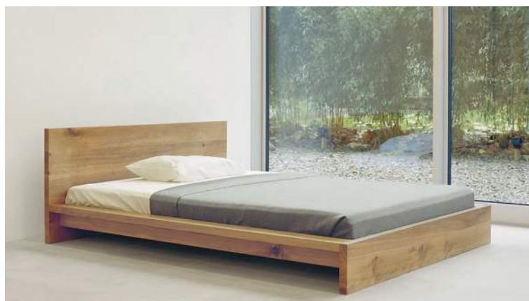
Figure 6: e15 SL02 Mo bed