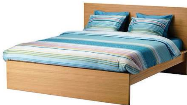
Figure 5: IKEA Malm bed