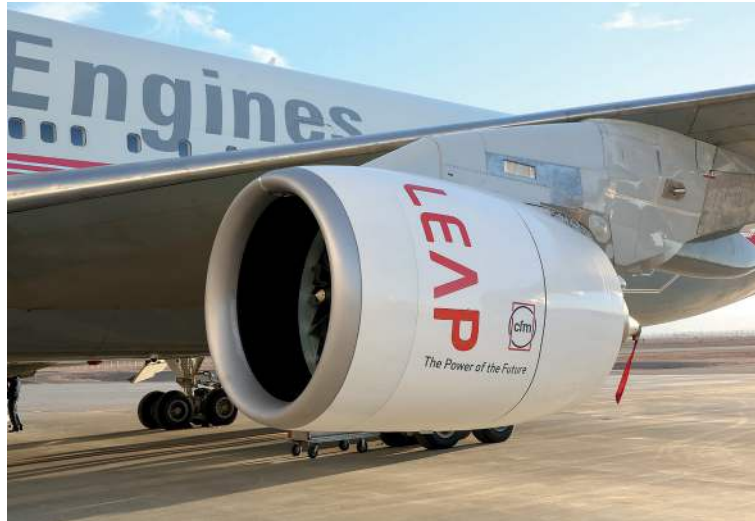
Figure 3: LEAP engine

The LEAP aircraft engine series, see Figure 3 , is the first to contain 3D printed components, see Figure 4 . It is also the first to receive simultaneous type certification by the Federal Aviation Administration and European Aviation Safety Agency.