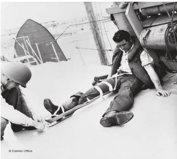
Figure 7: Eames splint in use