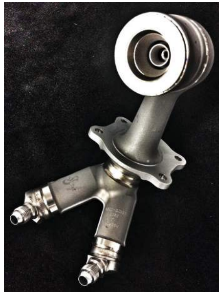
Figure 4: 3D printed fuel nozzle from LEAP engine